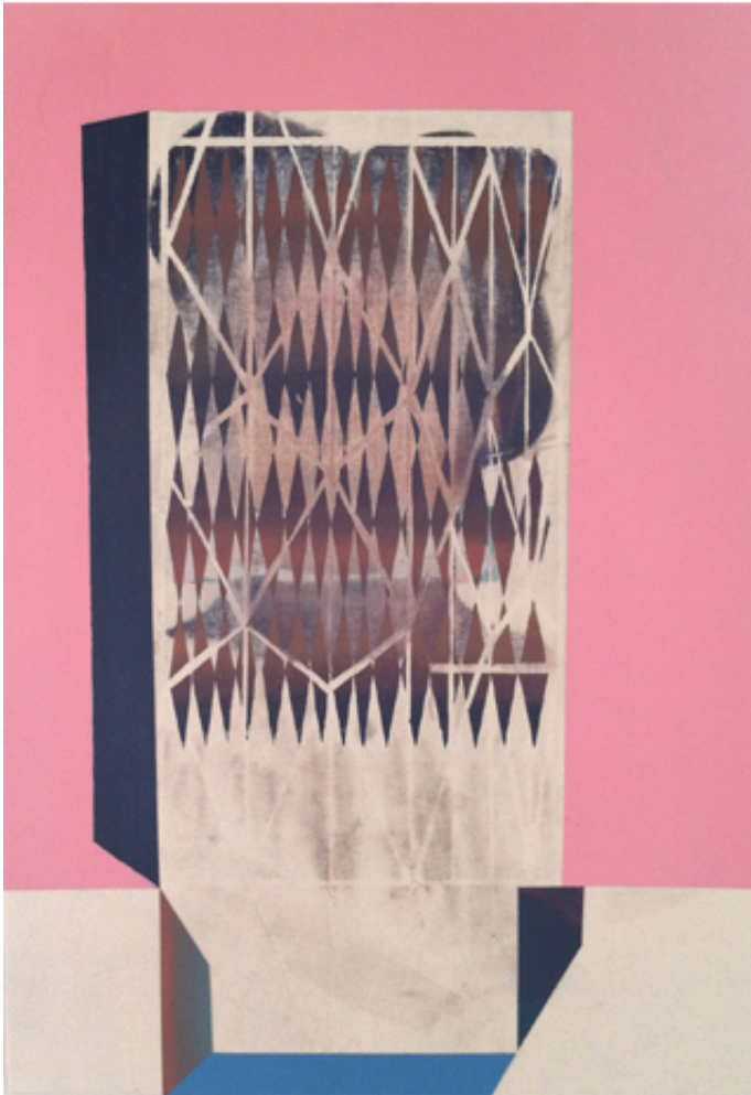
"A Avra do Fogo" by Rubens Ghenov, 2012, Acrylic and mate tea on canvas